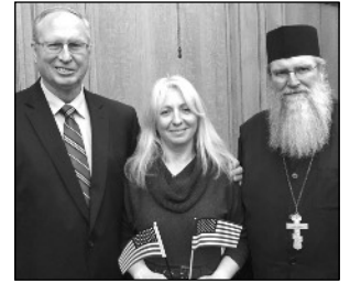
A New American

Visitation will be from 2:00 P.M. to 4:00 P.M. today at Rude's Funeral Home, Brookings, SD, with Trisagion Prayers at 3:30 P.M. The funeral service will be on Monday, 1:30 P.M. at St. Thomas More Catholic Church, 1700 8 th St. S., Brookings.